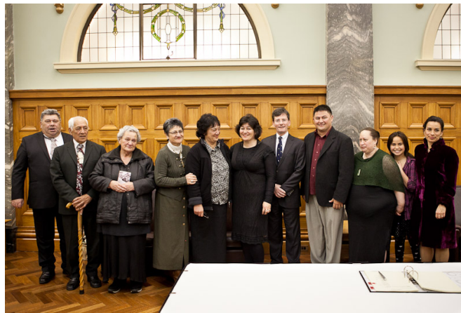
Photo: Maungaharuru-Tangitu Incorporated committee members and whānau.