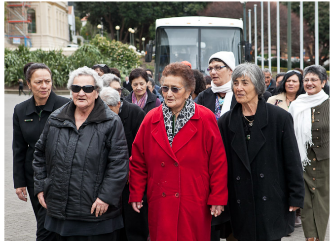
Photo: Whānau arriving at Parliament.

The Minister closed the formalities saying, “The Maungaharuru-Tangitu committee were very compelling in presenting your story to me. The Crown acknowledges the legitimacy of your grievances and your enduring sense of grievance in particular with regard to the Crown’s purchasing practises. I thank you all very much for your patience, determination and leadership.”