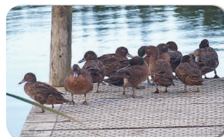
Pāteke at Lake Opouahi