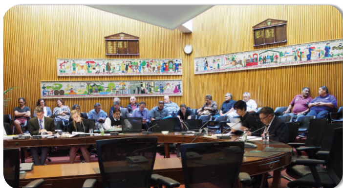
Photo: Whānau in support at the hearing before the Hastings District Council.

Earlier this year we asked the Hastings District Council to protect some of our pā, kāinga, and wāhi tapu under the Hastings District Plan.