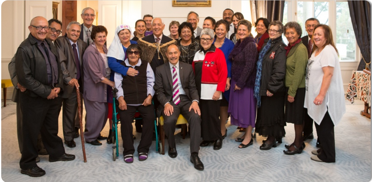
Above: Whānau with the Governor General, Lt Gen The Rt Hon Sir Jerry Mateparae at Government House.