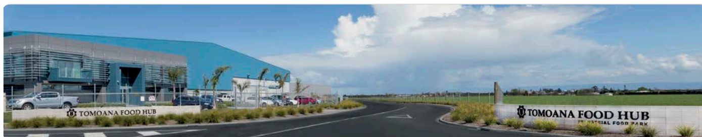
Above: Tomoana Food Hub, Elwood Road, Hastings.

On behalf of our Hapū, Maungaharuru-Tangitū Trust (MTT) has recently invested in 25% of Elwood Road Holdings Limited (ERHL) known as the Tomoana Food Hub. It is a partially-developed property hub, located at Elwood Road on the outskirts of Hastings.