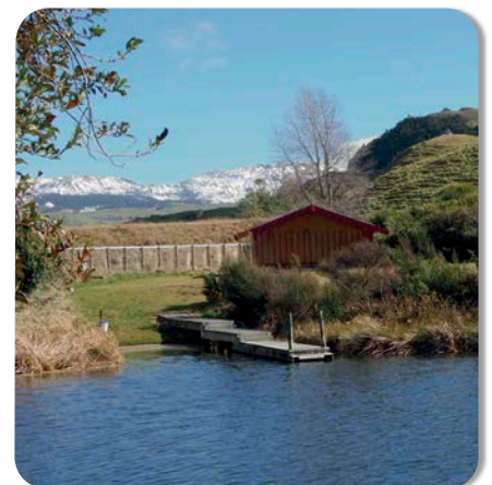
Above left to right: Whakaari at sunrise; Boundary Stream Reserve; Opouahi Scenic Reserve with the Wharewaka. The snowy ridgeline of Maungaharuru is visible in the background with Ahu-o-te-Atua to the left and Tarapōnui-a-Kawhea to the right.