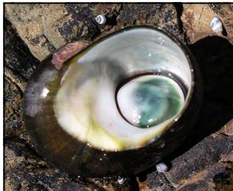
Pūpū (Bubu / cats eye) ( Turbo smaragdus )