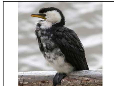
Kawau paka Little shag ( Phalacrocorax melanoleucos ) Regionally: endangered Nationally: not threatened