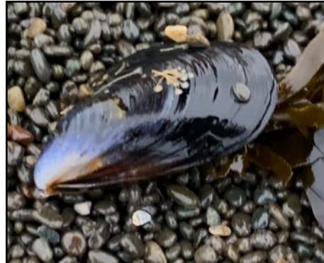
Torewai / toretore / pōrohe (Blue mussel) ( Mytilus galloprovincialis )