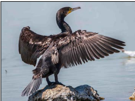
Kōau (kawau) Black shag ( Phalacrocorax carbo ) Nationally: at risk, naturally uncommon Regionally: data deficient