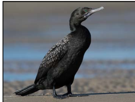
Kawau tūi Little black shag ( Phalacrocorax sulcirostris ) Nationally: at risk, naturally uncommon Regionally: data deficient