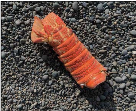
Kōura (Crayfish / Rock lobster)