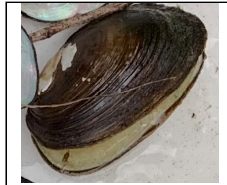
Kākahi (Freshwater mussel) ( Hyridella menziesi )