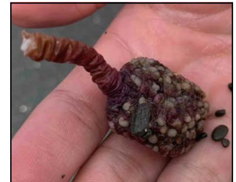
Kaiō (Sea squirt, sea tulip) ( Pyura pachydermatina )