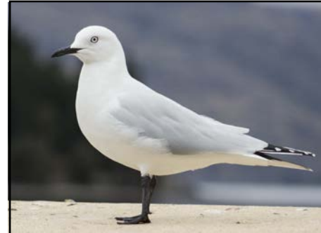
[Tarāpuka] Black-billed gull ( Larus bulleri ) Regionally: critical Nationally: critical