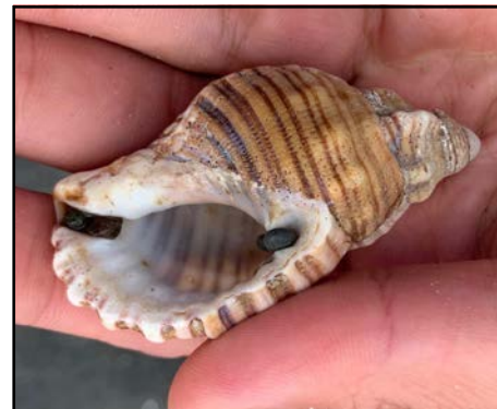
Whētiko (Sea snail) ( Argobuccinum pustulosum? )