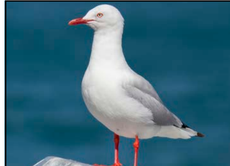
Tarāpunga Red-billed gull ( Larus novaehollandiae ) Regionally: vulnerable Nationally: at risk, declining