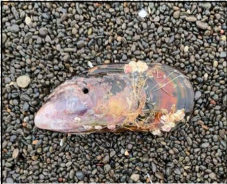
Kuku (Green-lipped mussel) ( Perna canaliculus )