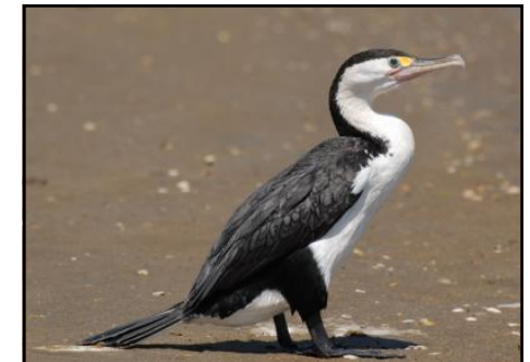
Kāruhiruhi Pied shag ( Phalacrocorax varius ) Regionally: vagrant Nationally: at risk, recovering