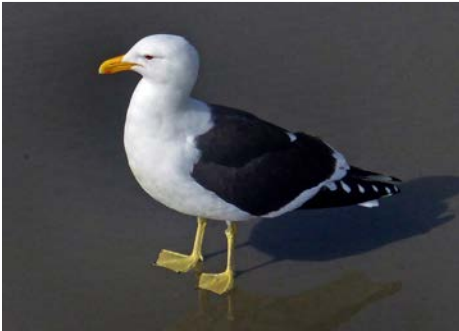
Karoro Southern black-backed gull ( Larus dominicanus ) Regionally: not threatened Nationally: not threatened